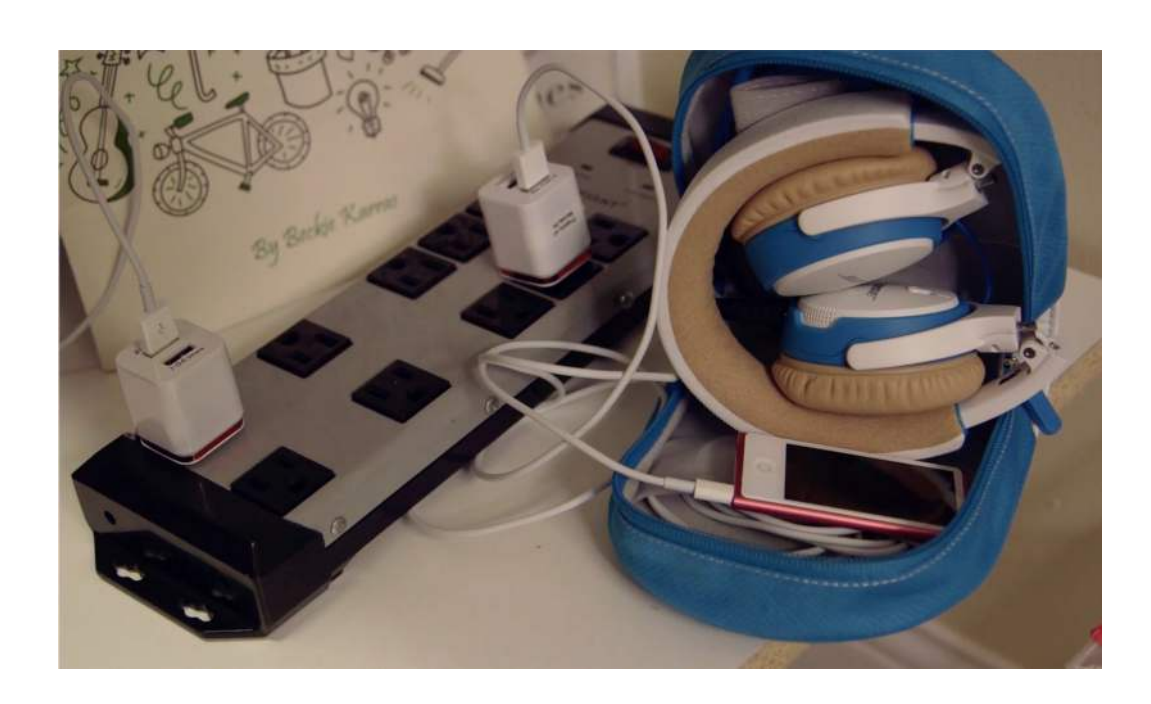
Watch the video Clearing and Cleaning your Music & Memory Equipment.

Keeping equipment clean is an important part of a music & memory program. As you pilot your program, you'll need to create a system for cleaning devices when they are not in use to ensure a safe listening experience for all participants. Use a cleaning solution consisting of 70% isopropyl alcohol and water, along with a microfiber cloth, to clean music players and cables, making sure to avoid getting the solution inside cable ports. In addition, some things should never be shared, such as headphones, unless you are using disposable earpads.